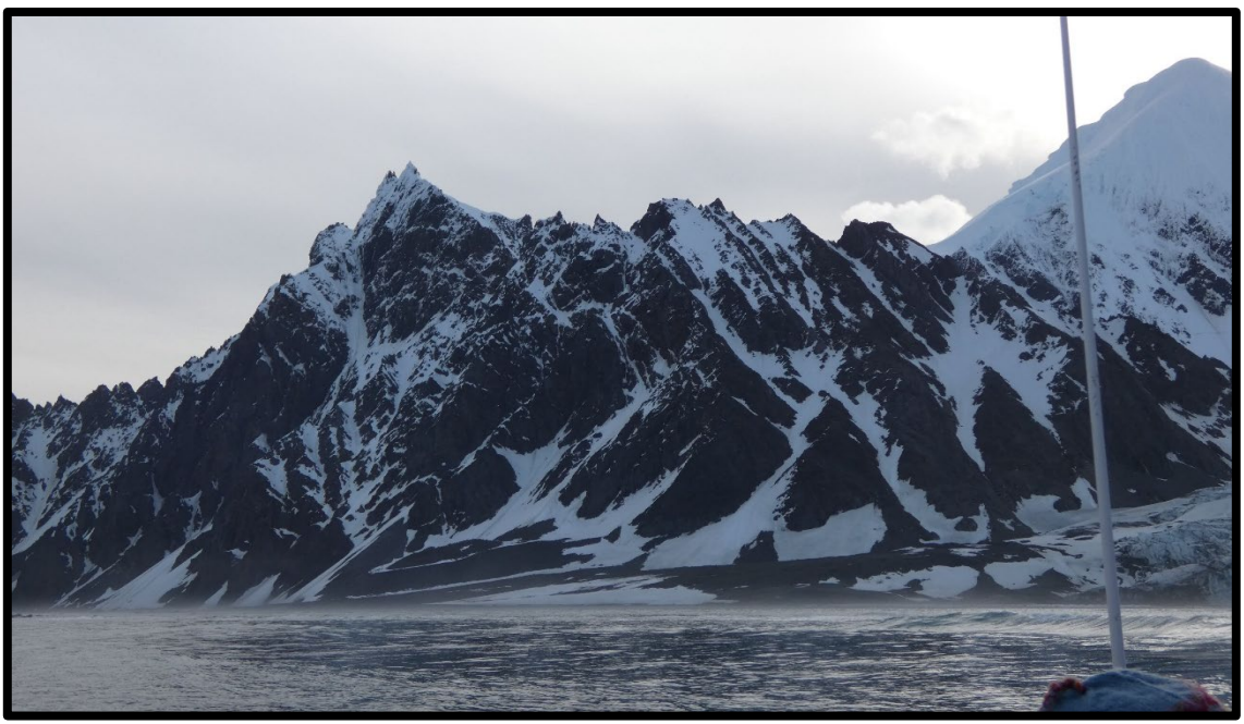
Figure 6 – Picture provided by passenger showing the shoreline during excursion (taken by passenger on 15Nov2022)