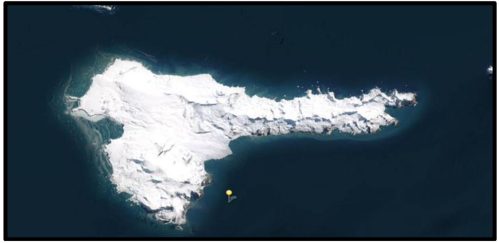
Figure 3- Satellite view of Elephant Island and location of WORLD EXPLORER