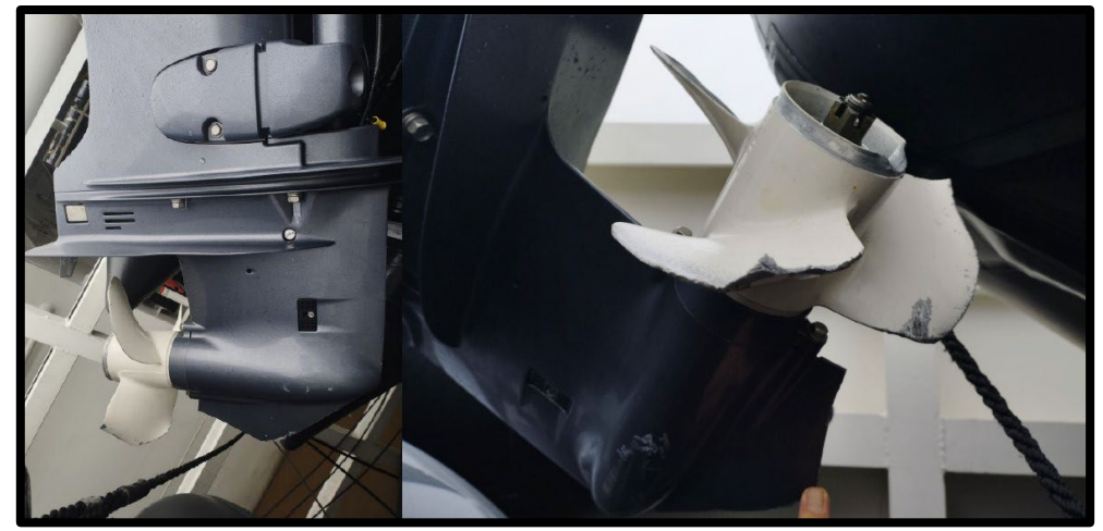
Figure 9 – Photos of damaged propeller on Zodiac #4