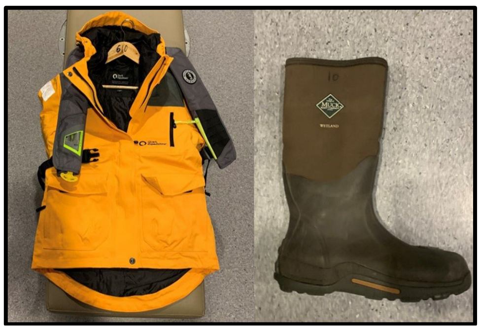
Figure 4 - Quark provided standard PPE for excursion operations (taken by USCG on 30Nov2022)

4.1.5. The WORLD EXPLORER crew prepared and lowered eight excursion Zodiacs into the water to conduct wildlife sightseeing excursions away from the shoreline without any planned landings. Prior to boarding the Zodiacs, all passengers were wearing the Quark-issued waterproof outerwear and inflatable PFDs. No passengers were wearing immersion PPE (i.e., dry suits or immersion suits).