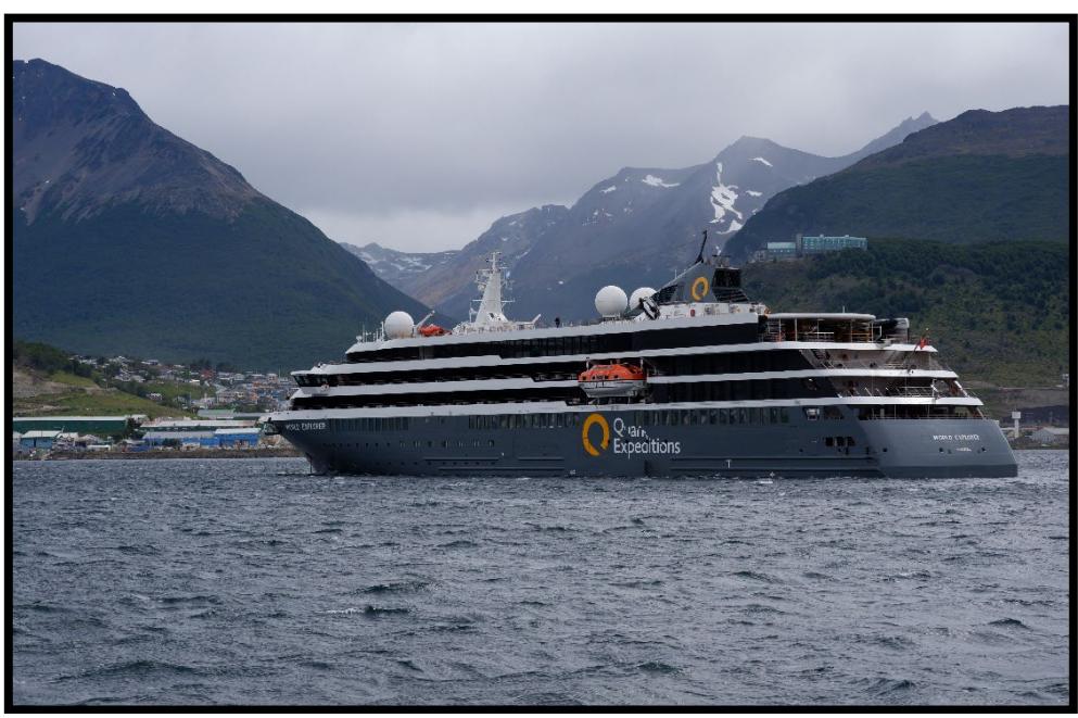
Figure 1- Photograph of WORLD EXPLORER in Ushuaia Anchorage