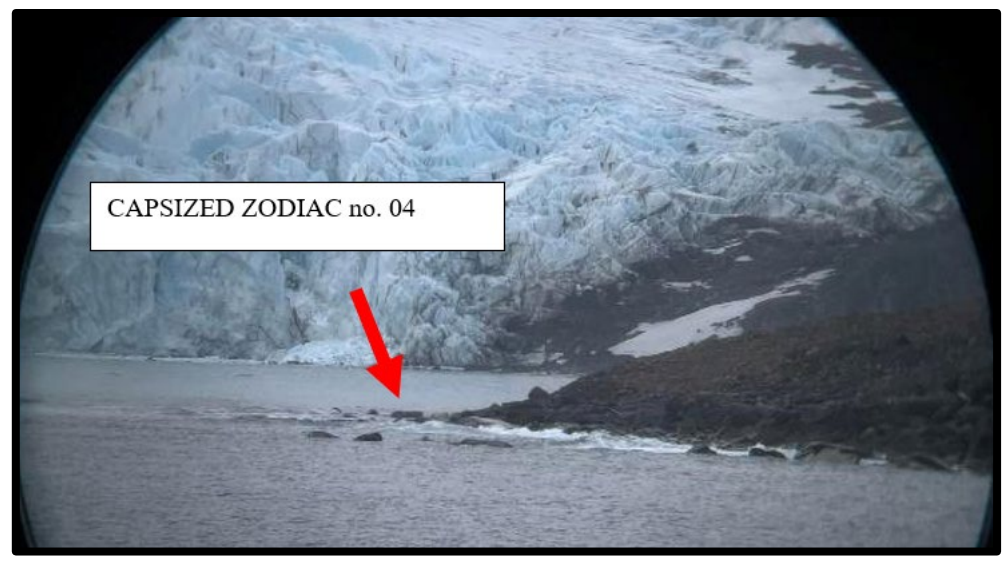
Figure 7 – Area where Zodiac #4 capsized showing glacial bay