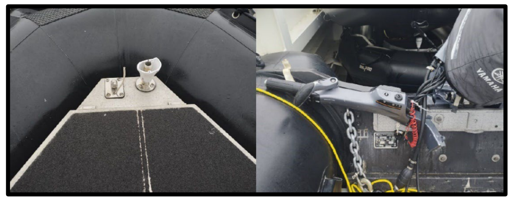
Figure 8 – Photos of damaged Zodiac #4 showing broken antenna and tiller