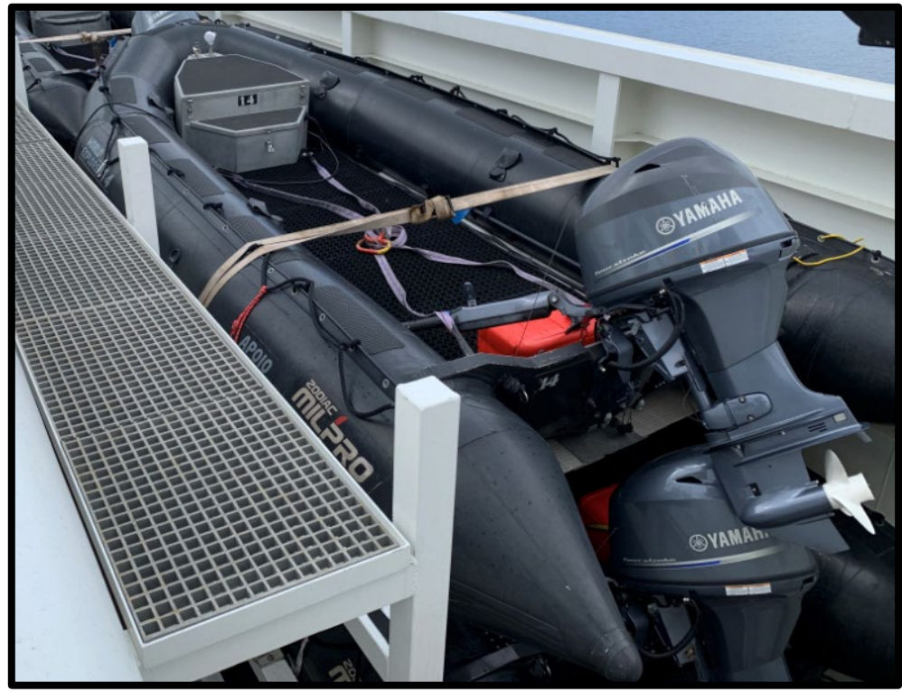
Figure 2- Photograph of Zodiac 14 – Same model as capsized Zodiac #4